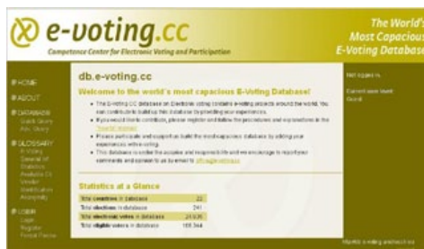
The database on electronic voting by E-Voting.CC

developers. It is based on the original research project but will incorporate the latest research efforts to map the use of electronic voting in the near future. The most important changes are a new and updated layout as well as the obligation to register and be approved to contribute and edit the entries in the database.